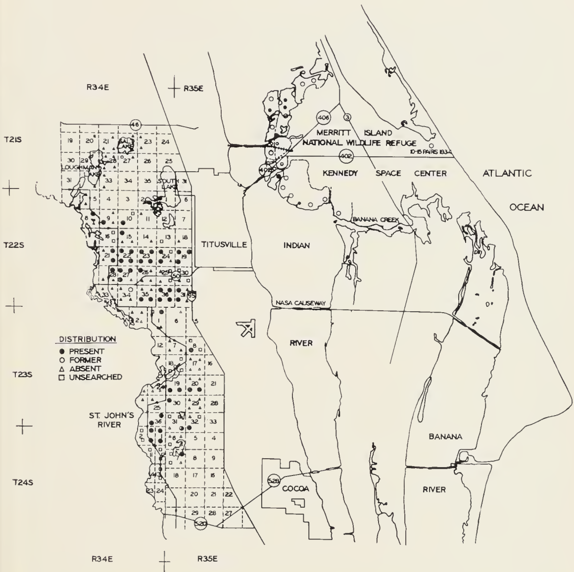
FIG. 1. Present and former distribution of the Dusky Seaside Sparrow, Brevard County, Florida.

at the moment on the rare and endangered species list of the U. S. Fish and Wildlife Service ( ibid. ). It was because of this critical situation that the present study was undertaken.